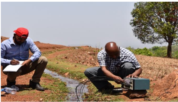
Fig.3. Uphill conduit -11.04.2019