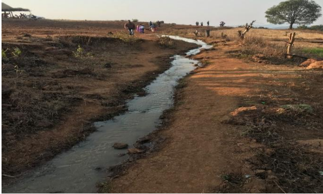
Fig.2. At top of the hill - 06.01.2019