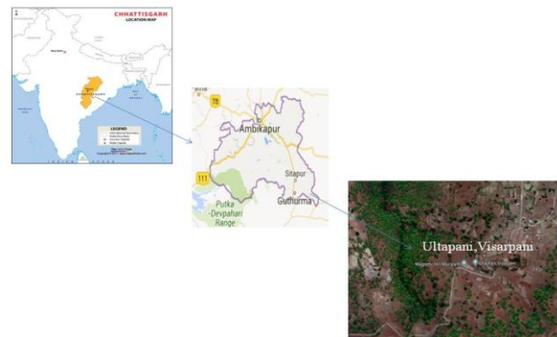
Fig.1 Location of Ultapani, Visarpani

In Surguja district, Mainpat is a block in the northern region of Chhattisgarh state in India and is located about 55 kilometres from Ambikapur showing in Fig.1. The geographical distance of the Mainpat is 35 km from Darima airport and about 55 km from district headquarter Ambikapur in Surguja division. The height of the Mainpat hill is about 3560 feet from its base. In this block, there is a place called Ultapani in village Visarpani, which is situated 5 km before Mainpat Kamleshwarpur Chowk on the 3 km right side of the Ambikapur–Mainpat road. The altitude of the Ultapani village Visarpani Mainpat is 1085 m above sea level in the world map, latitude of the surface water source is located at 22°52'52" N and longitude 83°17' 0" E. The water conduit starting from its source, called “Dhodhi” in local language, climbs itself to uphill of the slope of 45° and travels a distance about 150 meters and after turns towards downhill. The people of this area called it a caricature of the nature. From the survey, we found that the groundwater level is very near to earth surface on the village Visarpani. In this area, there is a dense forest nearby, in some portion of the Mainpat large number of geographical changes are observed.